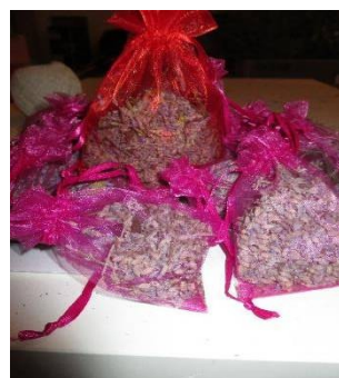
Image 4 - Bags of Lavadula Angustifolia

Seeking to establish the extent of compositional differences reflected in the therapeutic effect, we laid down the mnemotechnic profiles for the two oils, fresh and dry, and compared them with the standard,