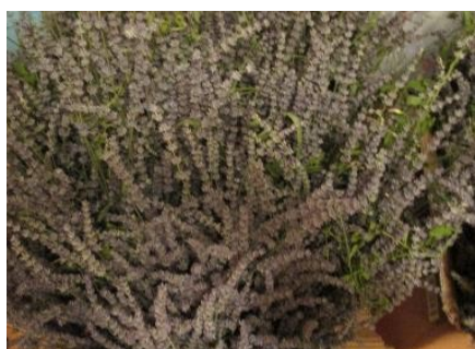
Image 2 - Lavandula Angustifolia flowers

In this situation, the only factors that could influence volatile oil's production and chemical composition were climatic factor. Monitoring the average monthly temperature variation in soil and air, rainfall and sunshine hours, we find that these could be determining factor for synthesis and different accumulation of terpenoids in plants.