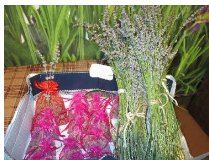
Image 3 - Bags of lavender and flowers