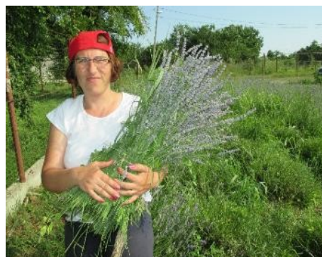
Image 1 - Photos of Lavandula crop in Bălteni, Dâmbovița